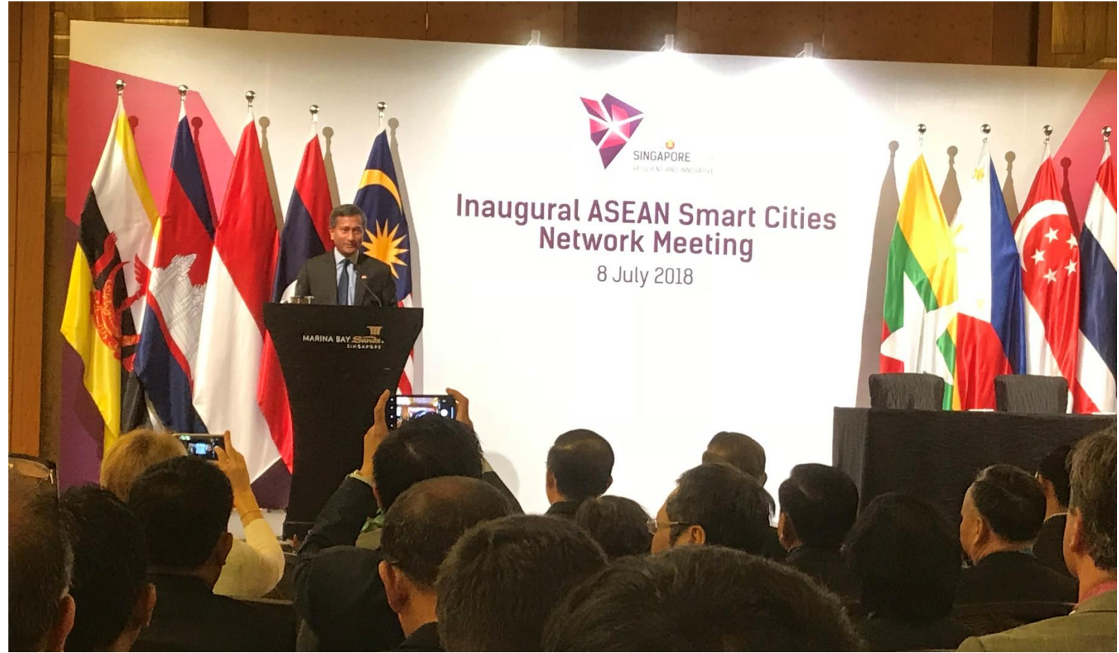
8 th July 2018 – The Inaugural ASCN Meeting at the World Cities Summit