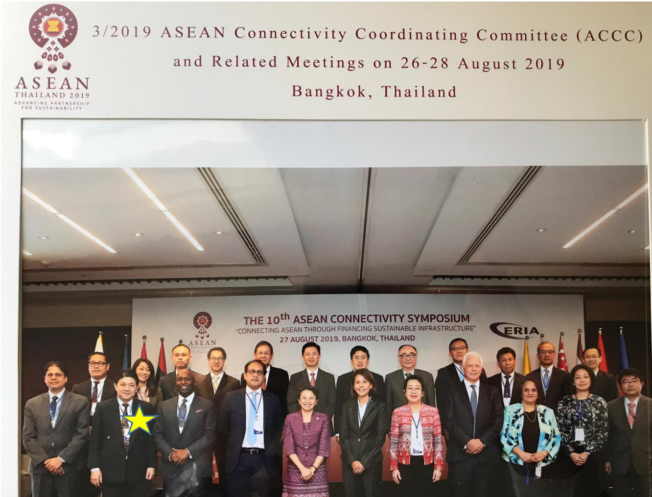
Group Photo taken of the Speakers and the ASEAN Connectivity Coordinating Committee (ACCC) at the ASEAN Connectivity Symposium in Bangkok on 27 th August 2019