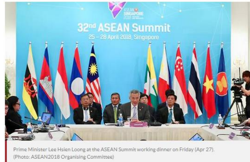
Prime Minister Lee Hsien Loong at the ASEAN Summit working dinner on Friday (Apr 27).